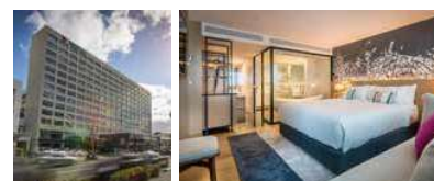
M Social Auckland