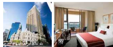
The Sebel Quay West