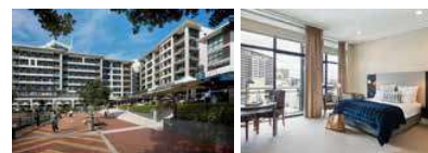
The Sebel Auckland Viaduct Harbour