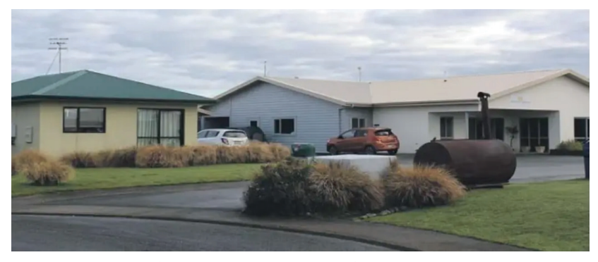
The Winton Lifestyle accommodation facility is a complex home to 22 units.

Charles Edward Francis Kidd has been sentenced for operating premises at 54 Church St in Winton, central Southland, with no current certificate of public use, and for failing to comply with a notice to fix staff accommodation at 50 Church St.