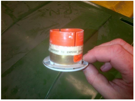
Concealed sprinkler extended due first fix fitout height error

The Fire Service have published a "Heads-Up" document which describes a residential care facility fire, in which poor installation and post installation modifications to a sprinkler system could have easily resulted a fatality within a sprinklered building