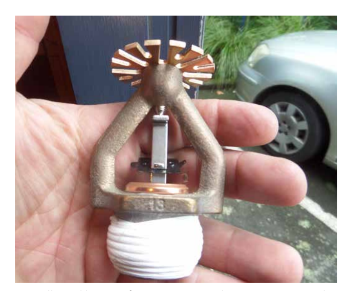
All sprinkler manufacturers recommend a maximum torque that sprinklers can be tightened too. Overtightening a sprinkler can lead to leakage, or even catastrophic failure.

This was at a site that had just had a very recent upgrade to ESFH. My understanding is that the correct usage of PTFE Tape is to only wrap the tape around the threads 3-5 times for it to work correctly. Is this something we should be watching out for? The manufacturer instructions say to use "a small amount of tape" when installing .... Generally when this much tape has been used they are trying to stop leaks, I was under the impression that most leaks on these styles of heads are due to incorrect installation, over torqueing, of not using the correct spanner and damaging the Head?