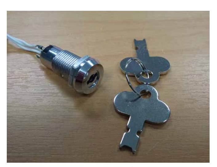
New Key Switch