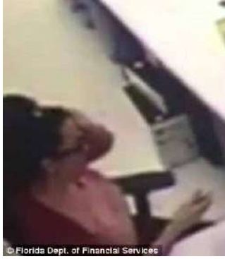
But instead of bouncing up, White could be seen picking up the metal hardware, and looking at it quizzically, before smashing it into her forehead seconds later.

She managed to avoid the maximum sentence of five years in prison, and was sentenced to 18 months of probation instead.