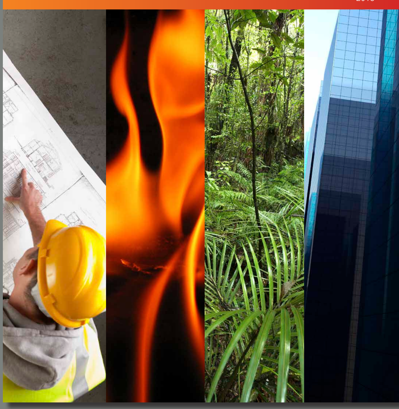
Fire Protection Association New Zealand