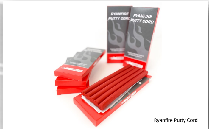
Ryanfire Putty Cord

Ryanfire Putty Cord is a great option around cables and small cable bundles. Please contact the technical department for specific and more detailed “V” drawings.