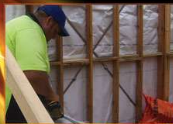
WINDOW REVEAL FIXING DETAIL