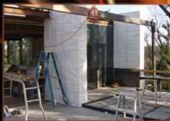
EASILY WRAPPED AROUND ARCHITECTURAL FEATURES - CALLIGNEE 2 VICTORIA