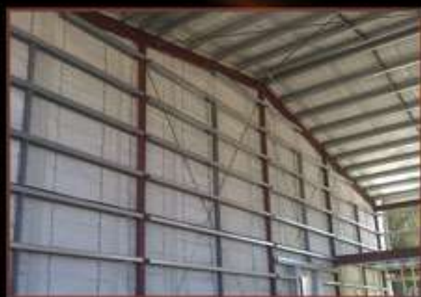
RFS BUILDING BAL-FZ WALL INSTALL NSW