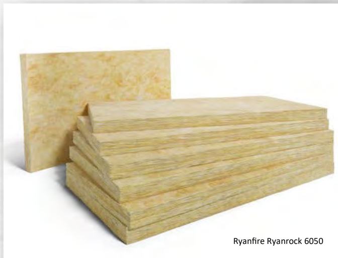
Ryanfire Ryanrock 6050

Ryanfire Ryanrock is a component used in conjunction with other Ryanfire products. Please contact the technical department for specific and more detailed "V" drawings.