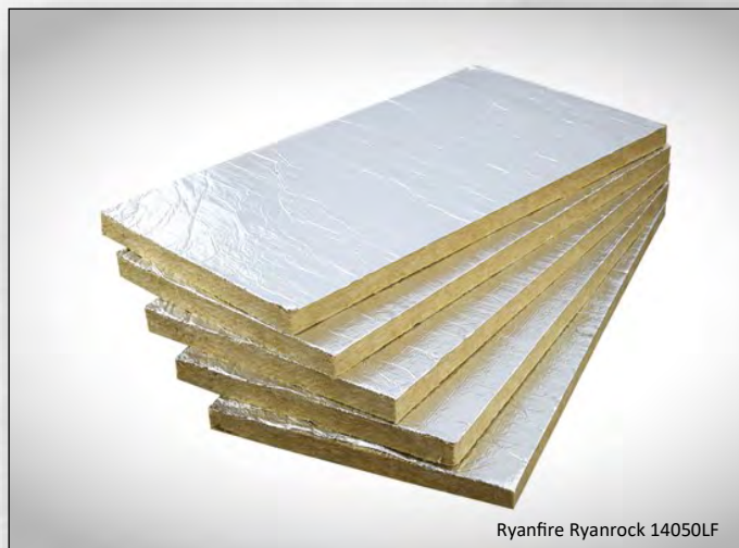
Ryanfire Ryanrock 14050LF

Ryanfire Ryanrock is a component used in conjunction with other Ryanfire products. Please contact the technical department for specific and more detailed "V" drawings.