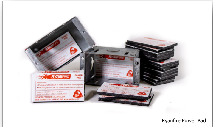
Ryanfire Power Pad

Ryanfire Power Pads are used within various types of separating elements. Please contact the technical department for specific and more detailed "V" drawings.