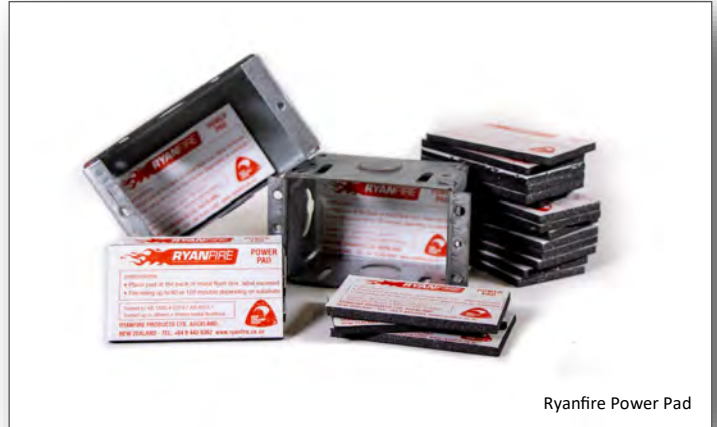
Ryanfire Power Pad

Ryanfire Power Pads are used within various types of separating elements. Please contact the technical department for specific and more detailed "V" drawings.