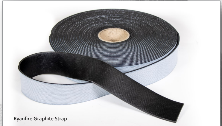
Ryanfire Graphite Strap

Ryanfire Graphite Strap is a component used in conjunction with other Ryanfire products. Please contact the technical department for specific and more detailed "V" drawings.