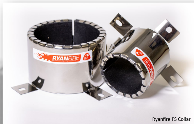
Ryanfire FS Collar

Ryanfire FS Collars are usually used in conjunction with other Ryanfire products. Please contact the technical department for specific and more detailed "V" drawings.