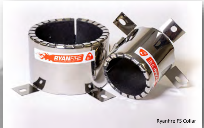
Ryanfire FS Collar

Ryanfire FS Collars are usually used in conjunction with other Ryanfire products. Please contact the technical department for specific and more detailed "V" drawings.