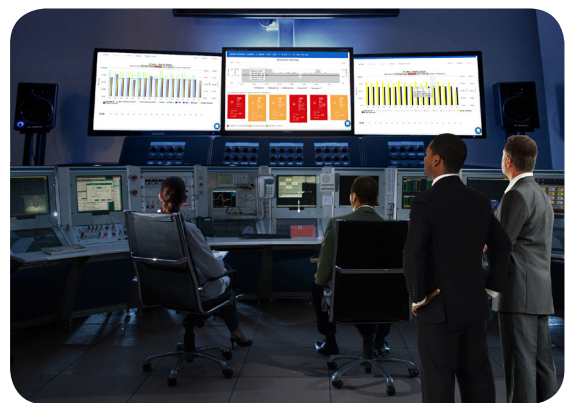
Clear Blue experts provide an ongoing support and management service.

Powerful Control. In the Cloud & Off the Grid.