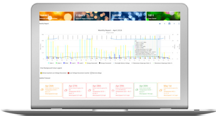
Illumience Cloud software remotely monitors, controls and manages the off-grid systems